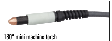
180° mini machine torch