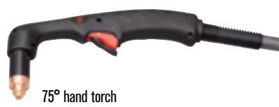
75° hand torch