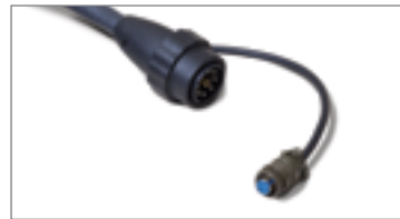
Mechanized torch lead with quick disconnect.