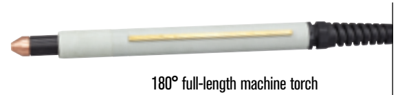
180° full-length machine torch

* When compared with standard T60/T80/T100 torches and/or consumables for Powermax1000/1250/1650.