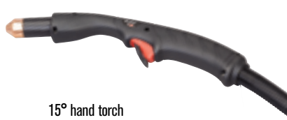
15° hand torch