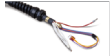
Handheld or mechanized torch lead without quick disconnect for Powermax600 CE systems.