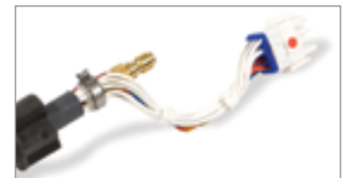
Easy Torch Removal (ETR) connection - makes Duramax retrofit torches easy plug-and-play upgrades