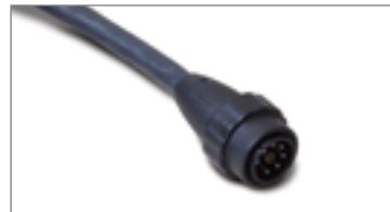
Handheld torch lead with quick disconnect.